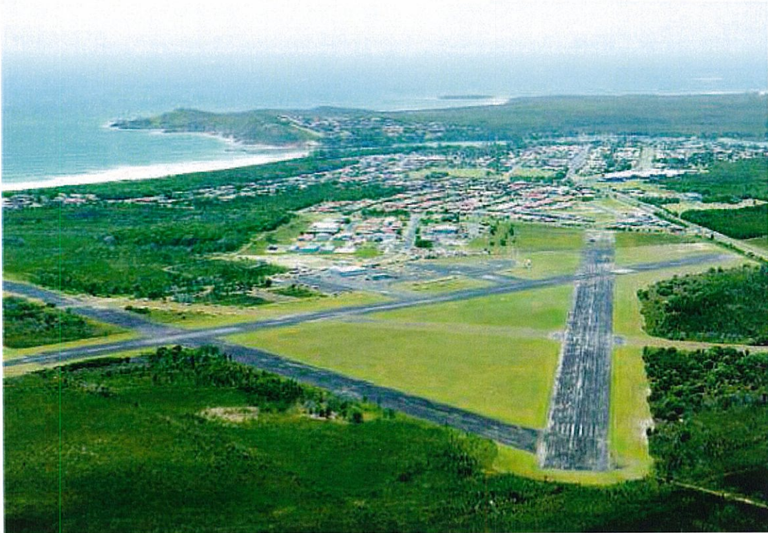
UP FOR GRABS: An aerial view of Evans Head Airport.